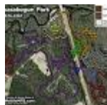
Chickasabogue Park Park