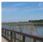
Meaher State Park State Park