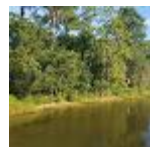
Village Point Park Preserve Nature Preserve