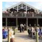
Five Rivers Delta Center State Government Office